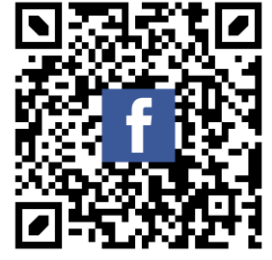
Follow on Facebook