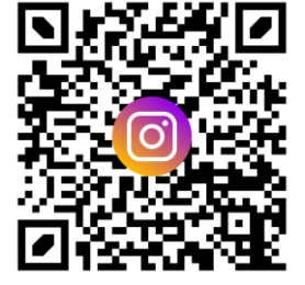
Follow on Instagram