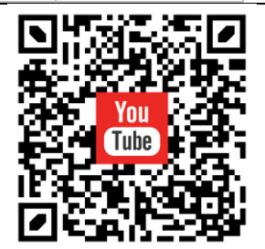
Follow on YouTube